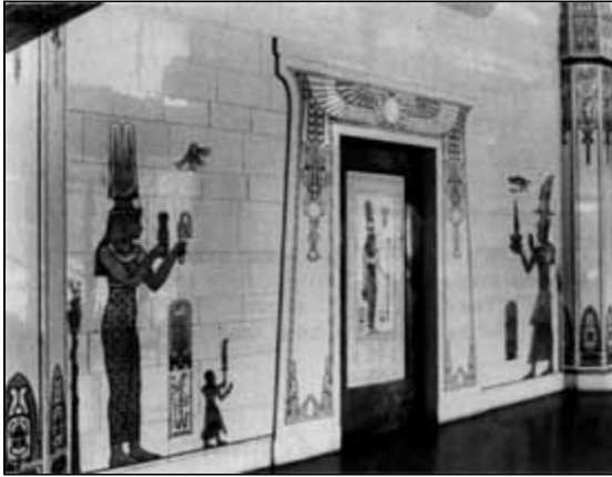
Owners of the Hadley Dean Glass Company Warehouse, St. Louis, preserved the unusual polychrome pigmented structural glass interior lobby.

to 1 inch x 4 inch wood furring strips with mastic (a full 4 inch width coverage was recommended around the edge of the panels). Brass wood screws and small rosettes, protected with felt exterior covers, provided additional support.