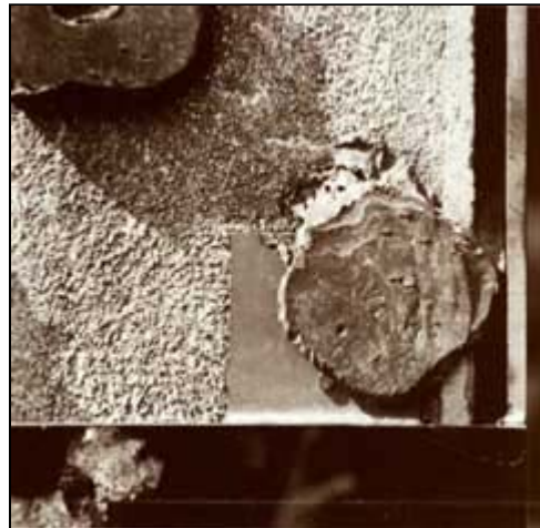
The pigmented structural glass panel has separated and fallen, exposing the substrate and hardened, brittle daubs of mastic.

The maintenance of a dry masonry substrate, mastic, and metal anchors is essential to the longevity of a pigmented structural glass veneer. Thus, repointing cracked or open joints--particularly at ground level where glass abuts concrete--and caulking of slightly cracked glass panels is an ongoing concern. Where drainage to conduct water away from the wall is faulty or insufficient, the problem should be immediately corrected. For example, roof flashing, downspouts, and gutters should be repaired or new systems installed.