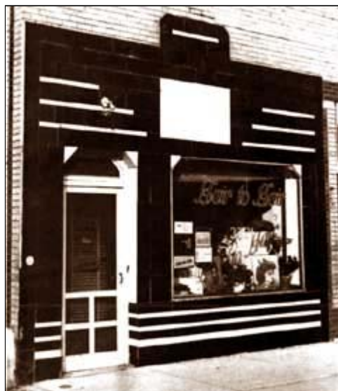
Owners of this small barber shop, Denver, Colorado, have successfully preserved the historic character of their pigmented structural glass storefront by patching the cracked panels with a dark caulking compound.

In reinstalling the glass panels (or new panels to replace any historic glass that has been broken), it is recommended that the mastic adhesive used throughout the 1930s and 1940s be used, because it is still the best bonding material. Although modern silicone compounds offer workability, adhesion, and flexibility, they tend to be expensive when used in the necessary quantity. On the other hand, butyl adhesives do not provide sufficient adhesion on