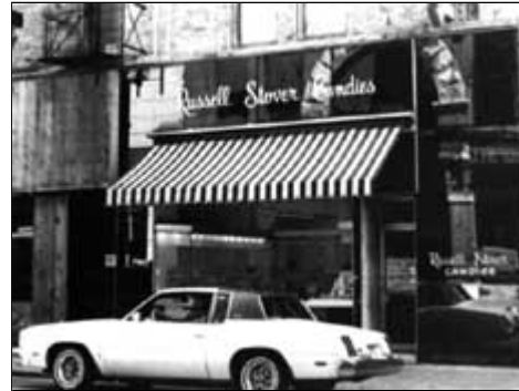
The Russell Stover Candies, Nashville, Tennessee, shows the company's historic use of deep, mirrored violet pigmented structural glass storefronts.

Although pigmented structural glass enjoyed widespread popularity from the beginning of the Great Depression to the outbreak of World War II, its origins can be traced to the turn of the century. In 1900, the Marietta Manufacturing Company claimed to be the first producer of pigmented structural glass, rolling the first sheet of a "substitute for marble," Sani Onyx. Penn-American Plate Glass Company quickly joined its ranks, manufacturing white and black Carrara Glass around 1906. Penn- American Plate Glass no doubt selected the name "Carrara" for the white glass's close resemblance to the white marble of the Carrara quarries of Italy. Shortly thereafter, Libby-Owens-Ford Glass began production of their own version called Vitrolite.