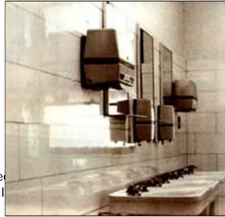
White pigmented structural glass was used in this remodeling of the U.S. Custom House, Denver, Colorado.

As a non-veneer material, pigmented structural glass was generally used for counter and table tops and restroom partitions.