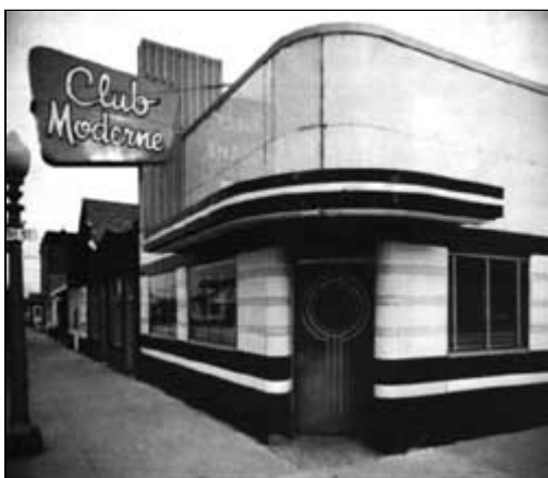
The Club Moderne, Anaconda, Montana, reflects the exceptional historic detailing associated with pigmented structural glass—polished-mirror finish, rounded corners, and horizontal polychrome bands.

The dramatic growth and popularization of the early 20th century Art Deco, Streamline, and Moderne architectural styles were fueled, in part, by technological advances in the building materials industry. New products, such as stainless steel and plastics, enlarged the realm of architectural design. The more traditional materials, on the other hand, quickly developed fresh, innovative forms and uses. For example, the architectural glass industry became especially creative, introducing a series of new glass products known as structural glass. Used predominately for wall surfacing, these now familiar products included glass building blocks, reinforced plate glass, and pigmented structural glass. Pigmented structural glass, popularly known under such trade names as Carrara Glass, Sani Onyx (or Rox), and Vitrolite, revolutionized the business and rapidly became a favorite building material of the period's architects and designers.