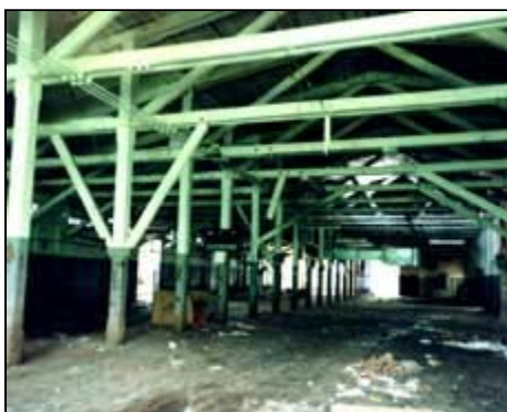
The interiors of mills and industrial buildings are frequently open, unadorned spaces with exposed structural elements. While these spaces can serve many new uses, the floor to ceiling height and exposed truss system are character-defining features that should be retained in rehabilitation.

A floor plan, the arrangement of spaces, and features and applied finishes may be individually or collectively important in defining the historic character of the building and the purpose for which it was constructed. Thus, their identification, retention, protection, and repair should be given prime consideration in every preservation project. Caution should be exercised in developing plans that would radically change character-defining spaces or that would obscure, damage or destroy interior features or finishes.