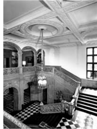
Not only are the features of this early 20th century interior worthy of preservation, the planned sequence of spaces impart a grandeur that is characteristic of high style residences of the period.

This Preservation Brief has been developed to assist building owners and architects in identifying and evaluating those elements of a building's interior that contribute to its historic character and in planning for the preservation of those elements in the process of rehabilitation. The guidance applies to all building types and styles, from 18th century churches to 20th century office buildings. The Brief does not attempt to provide specific advice on preservation techniques and treatments, given the vast range of buildings, but rather suggests general preservation approaches to guide construction work.