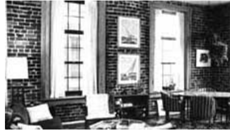
Plaster has been removed from perimeter walls, leaving brick exposed. The plaster should have been retained and repaired, as necessary.

9. Avoid removing paint and plaster from traditionally finished surfaces, to expose masonry and wood. Conversely, avoid painting previously unpainted millwork. Repairing deteriorated plasterwork is encouraged. If the plaster is too deteriorated to save, and the walls and ceilings are not highly ornamented, gypsum board may be an acceptable replacement material. The use of paint colors appropriate to the period of the building's construction is encouraged.