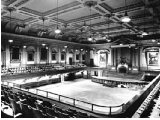
Many institutional buildings possess distinctive spaces or floor plans that are important in conveying the significance of the property. This grand hall, which occupies the entire floor of the building, could not be subdivided without destroying the integrity of the space.

which do not. Sometimes it will be the sequence and flow of spaces, and not just the individual rooms themselves, that contribute to the building's character. This is particularly evident in buildings that have strong central axes or those that are consciously asymmetrical in design. In other cases, it may be the size or shape of the space that is distinctive.