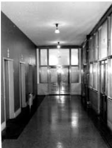
This corridor has glazed walls, oak trim, and marble wainscotting, typical of those found in the late 19th and early 20th century office buildings. Corridors such as this, displaying simple detailing, should be a priority in rehabilitation projects involving commercial buildings.

In assessing a building's interior, it is important to ascertain the extent of alteration and deterioration that may have taken place over the years; these factors help determine what degree of change is appropriate in the project. Close examination of existing fabric and original floorplans, where available, can reveal which alterations have been additive, such as new partitions inserted for functional or structural reasons and historic features covered up rather than destroyed. It can also reveal which have been subtractive, such as key walls removed and architectural features destroyed. If an interior has been modified by additive changes and if these changes have not acquired significance, it may be relatively easy to remove the alterations and return the interior to its historic appearance. If an interior has been greatly altered through subtractive changes, there may be more latitude in making further alterations in the process of rehabilitation because the integrity of the interior has been compromised. At the same time, if the interior had been exceptionally significant, and solid documentation on its historic condition is available, reconstruction of the missing features may be the preferred option.