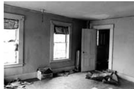
The interior of this 19th worker's house has not been properly maintained, but it may be as important historically as a richly ornamented interior. Its wide baseboards, flat window trim, and four-panel door should be carefully preserved in a rehabilitation project.

Secondary spaces are generally more utilitarian in appearance and size than primary spaces. They may include areas and rooms that service the building, such as bathrooms, and kitchens. Examples of secondary spaces in a commercial or office structure may include storerooms, service corridors, and in some cases, the offices themselves. Secondary spaces tend to be of less importance to the building and may accept greater change in the course of work without compromising the building's historic character.