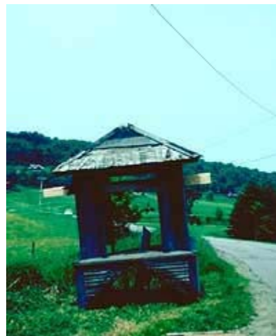
This cupola will be repaired and returned to the horse barn roof (see photo, above).

Roofing. Moisture can damage historic materials severely, and, in extreme cases, jeopardize the structural integrity of a building. Every effort must be made to secure a weathertight roof. This may require merely patching a few missing shingles on a roof that is otherwise sound. In more severe cases, it may require repairing or replacing failing rafters and damaged sheathing. Such extreme intervention, however, is not usual. More typical is the need to furnish "a new roof," that is, to replace the wooden shingles, asphalt shingles, slate shingles or metal covering the roof. Replacing one type of roofing with another can produce a drastic change in the appearance of historic buildings. Great care should be taken, therefore, to assess the contribution of the roof to the appearance and character of the barn before replacing one type of roofing material with another. While some substitute materials (such as synthetic slate shingles) can be considered, the highest priority should be to replace in-kind, and to match the visual qualities of the historic roof. Gutters and downspouts should be replaced if damaged or missing. Finally, dormers, cupolas, metal ventilators and other rooftop "ornaments" provide needed ventilation, and should be repaired if necessary.