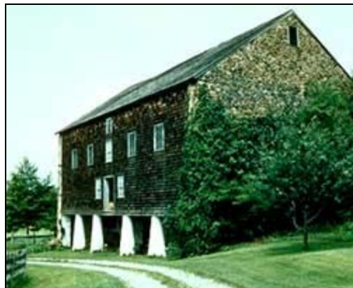
A gently sloping roadbed shows the "bank," from which bank barns get their name.

Bank barns were ordinarily constructed with their long side, or axis, parallel to the hill, and on the south side of it. This placement gave animals a sunny spot in which to gather during the winter. To take further advantage of the protection its location afforded, the second floor was extended, or cantilevered, over the first. The overhang sheltered animals from inclement weather. The extended forebay thus created is one of the most characteristic features of these barns. In some bank barns, the projecting beams were not large enough to bear the entire weight of the barn above. In these cases, columns or posts were added beneath the overhang for structural support.