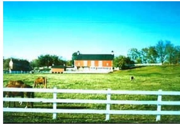
A barn is integral with its setting--orchards, ponds, fencing, streams, country roads, windmills, and silos.

Setting. Setting is one of the primary factors contributing to the historic character of a barn. Farmers built barns in order to help them work the land; barns belong on farms, where they can be seen in relation to the surrounding fields and other structures in the farm complex. A barn crowded by suburbs is not a barn in the same sense as is a barn clustered with other farm buildings, or standing alone against a backdrop of cornfields. Hence, the preservation of barns should not be divorced from the preservation of the setting: farms and farmland, ranches and range, orchards, ponds, fields, streams and country roads.