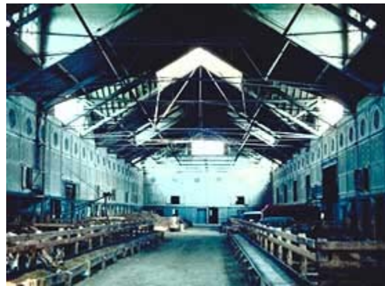
The interior of the barn in Shelburne, Vermont, is a magnificent space that included an overhead hay loft with tracks that allowed workers to drop hay to the floor below.

In large barns, this can be an imposing sight. More commonly, the barn is a combination of confined spaces on the lower floor and a large open space above; in this case, the contrast between the confined and open spaces is also striking. The openness of the interior, furthermore, often contrasts with the "blankness" typical of many barn exteriors, with their relatively few openings.