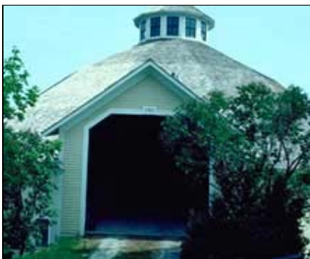
Circular barns are found throughout the country. This round barn, dated 1910, is in Vermont. It is 80 feet in diameter.

George Washington owned a round barn. And in 1826 the Shaker community at Hancock, Massachusetts, built a round barn that attracted considerable publicity. (4) Despite these early examples, however, round barns were not built in numbers until the 1880s, when agricultural colleges and experiment stations taught progressive farming methods based on models of industrial efficiency. From this time until well into the 1920s, round barns appeared on farms throughout the country, flourishing especially in the Midwest. (5)