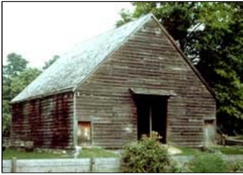
A gable roof, center wagon doors with pent roof, stock door at the corners, and horizontal clapboarding are all typical features of the Dutch barn.

The first great barns built in this country were those of the Dutch settlers of the Hudson, Mohawk, and Schoharie valleys in New York State and scattered sections of New Jersey. (2) On the exterior, the most notable feature of the Dutch barn is the broad gable roof, which in early examples (now extremely rare), extended very low to the ground.