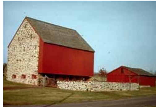
This well-maintained late 18th century barn is located in Worcester, Pennsylvania. Note the use of indigenous stone in the structure and surrounding fencing.

If a building is to be kept in good repair, periodic maintenance is essential. Barns should be routinely inspected for signs of damage and decay, and problems corrected as soon as possible. Water is the single greatest cause of building materials deterioration. The repair of roof leaks is therefore of foremost importance. Broken or missing panes of glass in windows or cupolas are also sources of moisture penetration, and should be replaced, as should broken ventilation louvers. Gutters and downspouts should be cleaned once or twice a year. Proper drainage and grading should be ensured, particularly in low spots around the foundation where water can collect.