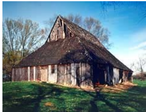
This 19th century tobacco barn, characterized by its steep gable-on-hip roof, is located in Prince Georges County, Maryland.

The barn types discussed here are only some of the barns that have figured in the history of American agriculture. As with Dutch barns, some reflect the traditions of the people who built them: Finnish log barns in Idaho, Czech and German-Russian house barns in South Dakota, and "threebay" English barns in the northeast. Some, like the New England connected barn, stem from regional or local building traditions. Others reflect the availability of local building materials: lava rock (basalt) in south-central Idaho, logs in the southeast, adobe in California and the southwest. Others are best characterized by the specialized uses to which they were put: dairy barns in the upper midwest, tobacco barns in the east and southeast, hop-drying barns in the northwest, and rice barns in South Carolina. Other historic barns were built to patterns developed and popularized by land-grant universities, or sold by Sears, Roebuck and Company and other mail-order firms. And others fit no category at all: these barns attest to the owner's tastes, wealth, or unorthodox ideas about agriculture. All of these barns are also part of the heritage of historic barns found throughout the country.