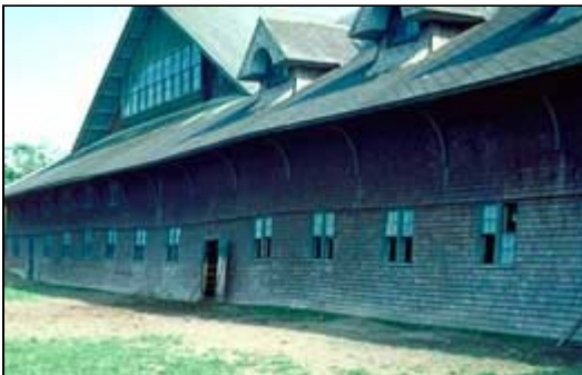
This enormous late 19th century barn in Shelburne, Vermont, displays a complexity

Form. The shape of barns, as with other buildings, is of great importance in conveying their character. (For round barns, the shape is the defining feature of the type.) Often the form of a barn is visible from a distance. Often, too, more than one side can be seen at the same time, and from several different approaches. As a general rule, the rear and sides of a barn are not as differentiated from the front, or as subordinated to it, as in other buildings.