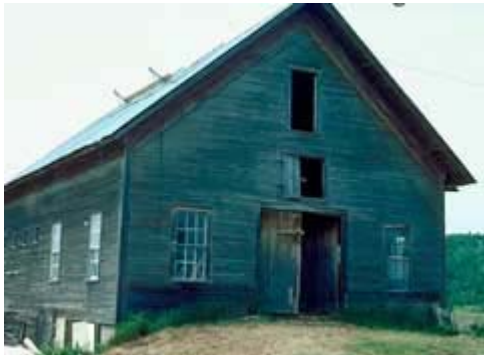
This horse barn, ca. 1875, is in Stowe, Vermont. Its cupola has been removed for repair.

Many historic barns require more serious repairs than those normally classed as "routine maintenance". Damaged or deteriorated features should be repaired rather than replaced wherever possible. If replacement is necessary, the new material should match the historic material in design, color, texture, and other visual qualities and, where possible, material. The design of replacements for missing features (for example, cupolas and dormers) should be based on historic, physical, or pictorial evidence.