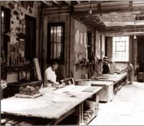
This plaster studio is well organized, with ample work space. Note the plaster casts hanging neatly on the wall.

the market. In the past, flexible molds were made with hide glue melted in a double boiler and poured over plaster originals which had been prepared with an appropriate parting agent. Of the newer rubbers, latex (painted on the model coat by coat) is time consuming and has little dimensional accuracy; polysulfide distorts under pressure; and silicone is needlessly expensive. Urethane rubber, with a 30-durometer hardness, is the current choice. Urethanes are manufactured as pourable liquids and as thixotropic pastes so that they can be used on vertical or overhead surfaces. The paste is especially useful for onsite impressions of existing ornament; the liquid is best used in the shop much as hide glue or gelatin was historically. Urethane rubber has the ability to reproduce detail as fine as a fingerprint and does not degrade