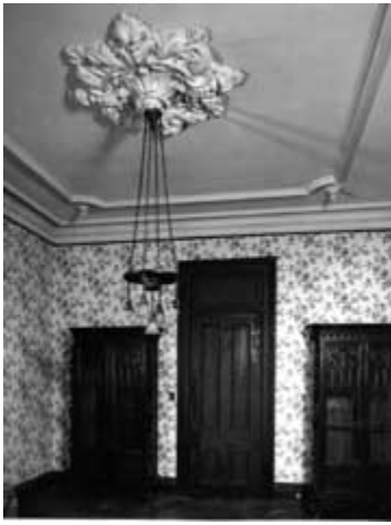
This parlor medallion and pendant drops shown in a mid-19th century house in Annapolis, Maryland, were originally ordered from a catalog.

Among the most dramatic of ornamental plaster forms is the parlor ceiling medallion . Vernacular houses often used plain-run concentric circles from which lighting fixtures descended, usually hung from a wrought iron hook embedded in the central ceiling joist. More elaborate medallions were composed of shop-cast pieces, such as acanthus foliage often alternating with anthemia or other decorative designs. Medallions usually related stylistically to the cornice ornament found in the room and could be created with or without a plain-run surround. Of particular importance to the art of ornamental plaster was the mid-19th century double parlor plan. Architects often specified matching medallions of robust proportions and ornamentation. Later, in 20th century American Colonial Revival architecture, architects called for Federal style ceiling medallions. Some of the more successful were graceful one-piece units, utilizing classical motifs such as garlands and swags, and in their simplicity, reminiscent of Adamesque designs of the 1760s.