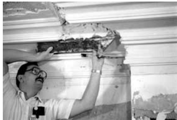
Mitering a plain-run cornice requires great dexterity using the miter rod.

of the molding profile mounted on a wooden "horse". Mitering was accomplished using a plaster and lime putty gauge (mix) tooled with miter rods at the joints. Decorative "enrichments" such as leaves, egg and dart moldings, and bead and reel units were cast in the shop and applied to the plain runs using plaster as an adhesive. Painting, glazing, and even gilding followed. Large houses often had plain run cornices on the upper floors which were not used for entertaining; modest houses also boasted cornice work without cast enrichment.