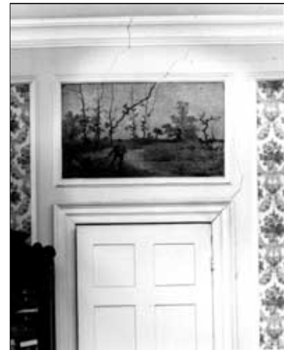
Settlement caused stress cracking through both flat wall and ornamental plaster. Repairs to the cornice molding involve chamfering the stress cracks to a "V groove," and patching with a mixture of gypsum and lime.

or loss of all three coats has occurred and is not combined with major structural failure, it can be repaired much like flat wall plaster. For ornamental plaster, however, repair beyond patching is often equivalent to targeted replacement of entire lengths or portions of run-in-place and cast ornamentation. Pieces that are deteriorated or damaged beyond plain patching must be removed and replaced with new pieces that exactly match the existing historic plaster. For this reason, partial restoration is often a more accurate term than repair. But whichever term is used, it is not recommended that repair of ornamental plaster be undertaken at any level by property owners; it is a craft requiring years of training and experience. A qualified professional should always be called in to make an inventory of ornamental plaster enrichments and to identify those details which are repairable onsite and which should be removed for repair or remanufacture in the shop.