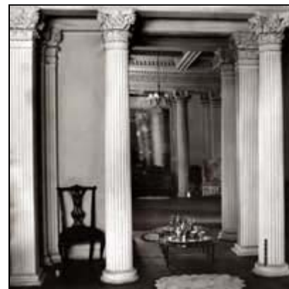
These Greek Revival columns (Gaineswood, Demopolis, Alabama, c. 1842-60) were drawn from Minard Lafever's Beauties of Modern Architecture of 1835. This bold new style began in New York

Locating an experienced contractor who is suitable for