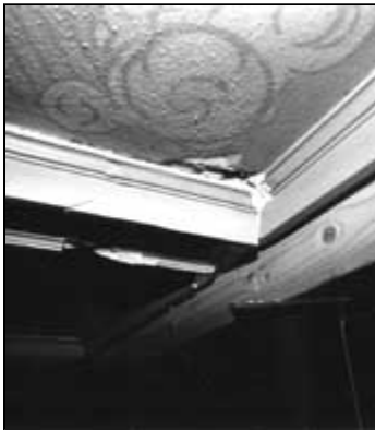
Structural settling has caused this ceiling to deflect. A structural engineer will shore-up the ceiling from below and re-attach the sagging ceiling plaster with the joists above.

Signs of Failure. Failure of the substrate is more typical than failure of the plaster ornament itself. Among the reasons for deterioration, structural movement and water intrusion are the most deleterious. Buildings move and settle, causing deflection and delamination which result in stress cracking. These cracks often begin at the corners of windows and doors and extend upward at acute angles. Roof or plumbing leaks make finishes discolor and peel and cause efflorescence, especially on plain-run or enriched cornices. Unheated buildings with water intrusion are subject to freeze-thaw cycles which ultimately result in base coat and ornamental plaster failure.