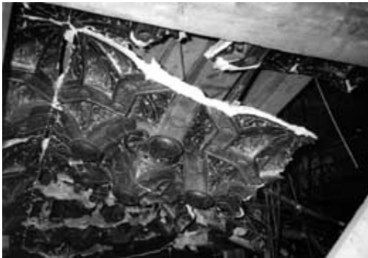
The Yiddish Arts Theater, New York City, c. 1920s. The concrete roof of this building had collapsed, damaging portions of the existing Moorish style coffered ceiling. The square coffer unit was easily identifiable and was removed to a casting shop for reproduction.

Coffered Ceiling. Like cornices and medallions, coffered ceilings suffer from poor maintenance practices and structural problems; however, these individually cast ceiling units are particularly vulnerable when a building is being rehabilitated and great care is not taken in executing the work. In the most serious of cases, portions of a roof can collapse, dropping heavy debris through the hanging coffering panels, and demolishing large portions of the ornamentation.