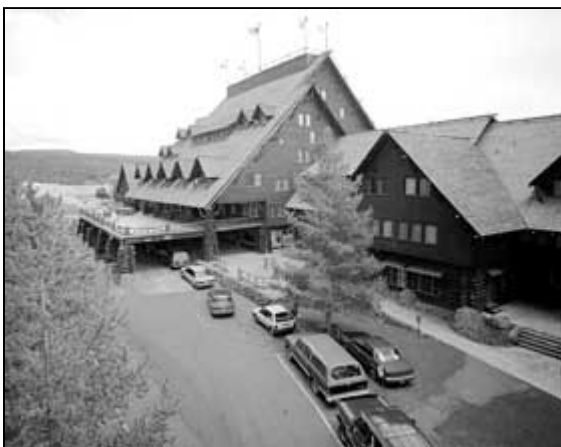
Old Faithful Inn, Yellowstone National Park, Wyoming brought the Rustic style to the West in 1903 in an original design, and a scale befitting its setting.

While many parts of the country never stopped building with logs, wooden balloon frame construction had made it obsolete in some of the more populous parts of the country by about the mid-19th century. However, later in the century, log construction was employed in new ways. In the 1870s, wealthy Americans initiated the Great Camp Movement for rustic vacation retreats in the Adirondack Mountains of upstate New York. Developers such as William Durant, who used natural materials, including wood shingles, stone, and log--often with its bark retained to emphasize the Rustic style--designed comfortable summer houses and lodges that blended with the natural setting. Durant and other creators of the Rustic style drew upon Swiss chalets, traditional Japanese design, and other sources for simple compositions harmonious with nature.