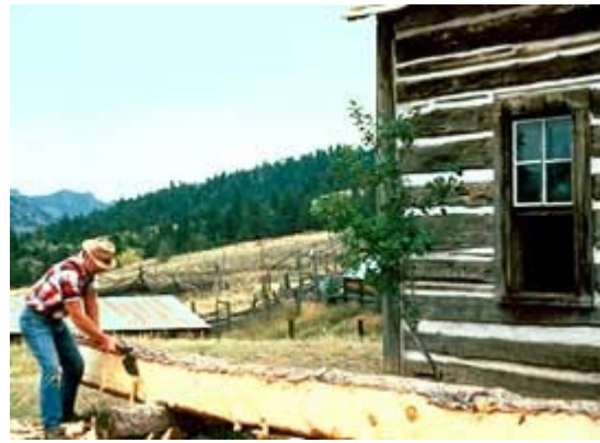
A log to replace the deteriorated sill is being hewn in the traditional manner with a broad axe.

sometimes be a clue to the ethnic craft origin of a log building, but it is important not to draw conclusions based only on notching details. Numerous corner notching techniques have been identified throughout the country. They range from the simple "saddle" notching, which demands minimal time and hewing skill, to the very common "V" notching or "steeple" notching, to "full dovetail" notching, one of the tightest but most time-consuming to accomplish, "half-dovetail" notching which is probably one of the most common, and "square" notching secured with pegs or spikes.