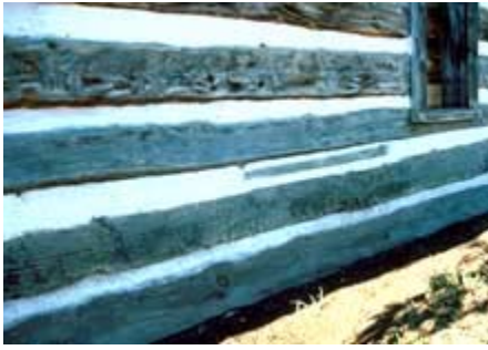
The new sill matches the original and is a compatible replacement.

interior, abutting partition walls and plaster may also need to be removed around the log to determine what, if any, features are supported by or tied into the log to be removed.