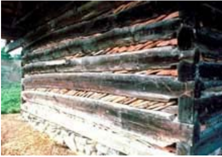
Stone or wood strips served to fill in the chinking areas over which the daubing was applied.

the log pen by sealing them against driving wind and snow, helping them to shed rain, and blocking the entry of vermin. In addition, chinking and daubing could compensate for a minimal amount of hewing and save time if immediate shelter was needed. Not all types of log buildings were chinked. Corncribs, and sometimes portions of barns where ventilation was needed were not chinked. While more typical of Swedish or Finnish techniques, and not as common in American log construction, tight-fitting plank-hewn or scribed-fit round logs have little or no need for chinking and daubing.