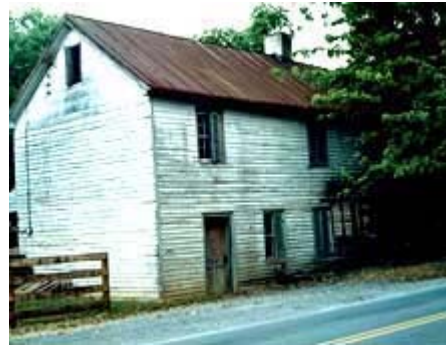
Unlike western log cabins, 18th and 19th century log houses in the eastern part of the U.S. were almost always covered with siding or stucco.

A distinction should be drawn between the traditional meanings of "log cabin" and "log house." "Log cabin" generally denotes a simple one, or one-and-one-half story structure, somewhat impermanent, and less finished or less architecturally sophisticated. A "log cabin" was usually constructed with round rather than hewn, or hand-worked, logs, and it was the first generation homestead erected quickly for frontier shelter. "Log house" historically denotes a more permanent, hewn-log dwelling, either one or two stories, of more complex design, often built as a second generation replacement. Many of the earliest 18th and early 19th century log houses were traditionally clad, sooner or later, with wood siding or stucco.