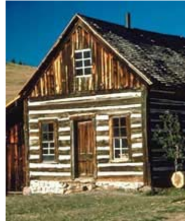
The entrance door centered in the gable end in this late-19th century log building is a typical feature of the Rocky Mountain Cabin style.

farmers and ranchers began to construct log buildings in the Rocky Mountains, the Northwest, California, and Alaska. In California and Alaska, Americans encountered log buildings that had been erected by Russian traders and colonists in the late 18th and early 19th centuries. Scandinavian and Finnish immigrants who settled in the Upper Midwest later in the 19th century also brought their own log building techniques with them. And, many log structures in the Southwest, particularly in New Mexico, show Hispanic influences of its early settlers.