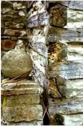
Daubing composed entirely of portland cement is never appropriate to use on a historic log building.

wooden strips or with daubing, should not be done until all log repair or replacement, structural jacking and shoring is completed, and all replacement logs have seasoned. Historically, patching and replacing daubing on a routine basis was a seasonal chore. This was because environmental factors--building settlement, seasonal expansion and contraction of logs, and moisture infiltration followed by freeze-thaw action--cracks and loosens daubing. If the exterior log walls are exposed, and the chinking or daubing requires repair, as much of the remaining inner blocking filler and daubing should be retained as possible. A daubing formula and tooled finish that matches the historic daubing, if known, should be used, or based on one of the mixes listed here. For the most part, modern commercially-available chinking products are not suitable for use on historic log buildings, although an exception might be on the interior of a log building where it will be covered by plaster or wood, and will not be visible. These products tend to have a sandy appearance that may be compatible with some historic daubing, but the color, and other visual and physical characteristics are generally