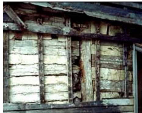
Once the siding is gone, the logs may rapidly deteriorate unless another protective treatment is applied.

In some instances, the exterior (and interior) of the logs was whitewashed. This served to discourage insects, and sealed hairline cracks in the daubing and fissures between the daubing and logs. Although the solubility of whitewash allows it to heal some of its own hairline cracks with the wash of rain, like daubing it has to be periodically reapplied. Usually, a more permanent covering such as wood siding or stucco was applied to the walls, which provided better insulation and protection, and reduced the maintenance of the log walls.