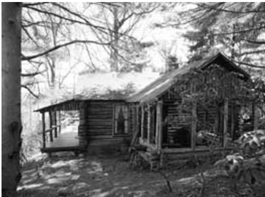
Rustic log structures were a popular choice for vacation cabins in the 20th century.

The intent of this Brief is to present a concise history and description of the diversity of American log buildings and to provide basic guidance regarding their preservation and maintenance. A log building is defined as a building whose structural walls are composed of horizontally laid or vertically positioned logs. While this Brief will focus upon horizontally-laid, corner-notched log construction, and, in particular, houses as a building type, the basic approach to preservation presented here, as well as many of the physical treatments, can be applied to virtually any kind of log structure.