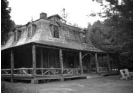
This lodge constructed of logs in the 1880s is an example of the Adirondack style of rustic camp architecture.

southwest as eastern Texas. Log buildings are known to have been constructed as temporary shelters by soldiers during the Revolutionary War, and across the country, Americans used logs not only to build houses, but also commercial structures, schools, churches, gristmills, barns, corncribs and a variety of outbuildings.