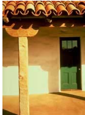
Tapered barrel clay roof tiles were custom made for the restoration of the 1820s Indian barracks at Mission Santa Cruz in California.

Dutch settlers on the east coast first imported clay tiles from Holland. By 1650, they had established their own full-scale production of clay tiles in the upper Hudson River Valley, shipping tiles south to New Amsterdam. Several tile manufacturing operations were in business around the time of the American Revolution, offering both colored and glazed tile and unglazed natural terra-cotta tile in the New York City area, and in neighboring New Jersey. A 1774 New York newspaper advertised the availability of locally produced, glazed and unglazed pantiles for sale that were guaranteed to "stand any weather." On the west coast clay tile was first manufactured in wooden molds in 1780 at Mission San Antonio de Padua in California by Indian neophytes under the direction of Spanish missionaries.