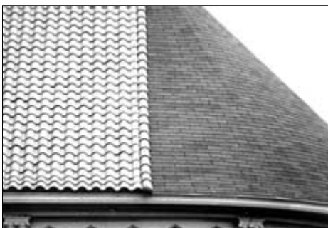
Asphalt shingles are an incompatible replacement substitute for the original Spanish clay tiles.

In addition to sheet metal "tile" roofs introduced in the middle of the 19th century, concrete roofing tile was developed as another substitute for clay tile in the latter part of the 19th century. It became quite popular by the beginning of the 20th century. Concrete tile is composed of a dense mixture of portland cement blended with aggregates, including sand, and pigment, and extruded from high-pressure machines.