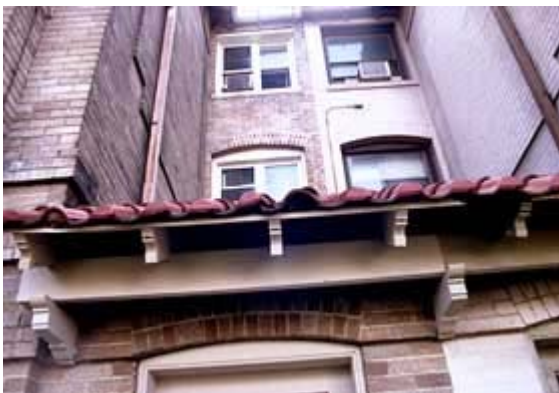
An eave closure or birdstop to keep out birds is notably absent from the replacement tile in the center of the bottom row.

Today some tile manufacturers have given their own trademark name to historic tile shapes. Other companies market uniquely shaped "S" tiles that are more in the shape of a true, but rather low profile "s" without the customary flat portion of traditional American "S" tiles.