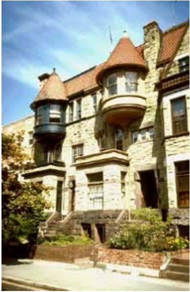
Clay tile was a popular roofing material for residential structures during the Romanesque Revival period.

attachment. It will conclude with general guidance for the historic property owner or building manager on how to plan and carry out a project involving the repair and selected replacement of historic clay roofing tiles.