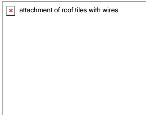
A special system consisting of brass or copper wires is used to attach these tapered barrel roof tiles.

that the roof is leaking, finding the source of the leak may not be so easy. It may require thorough investigation in the attic, as well as going up on the roof and removing tiles selectively in the approximate area of the roof leak. The source of the leak may not actually be located where it appears to be. Water may come in one place and travel along a roofing member some distance from the actual leak before revealing itself by a water stain, plaster damage, or rotted wooden structural members.