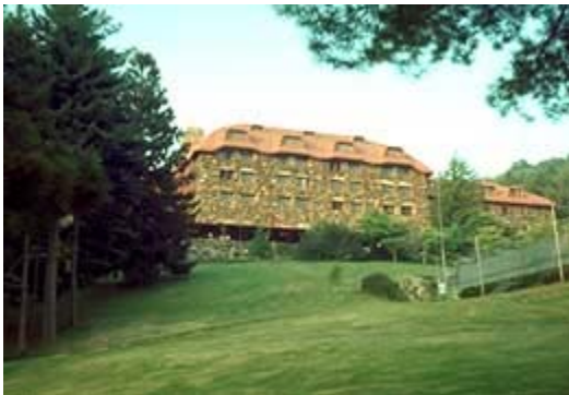
The clay tile roof is important in defining the character of the c. 1917 Mission-style Grove Park Inn, Asheville, North Carolina.

By the mid-19th century, the introduction of the Italianate Villa style of architecture in the United States prompted a new interest in clay tiles for roofing. This had the effect of revitalizing the clay tile manufacturing industry, and by the 1870s, new factories were in business, including large operations in Akron, Ohio, and Baltimore, Maryland.