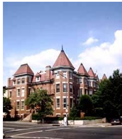
Clay tiles emphasize the prominence of the peaked roofs of these late 19th century rowhouses.

The popularity of clay tile roofing, and look-alike substitute roofing materials, continues in the 20th century, especially in areas of the South and West--most notably Florida and California--where Mediterranean and Spanish--influenced styles of architecture still predominate.