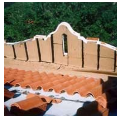
Projections on the underside of these replacement Spanish clay tiles help them adhere to the cement mortar on the roof sheathing.

Partly because they do not always fit together very closely, some tile shapes, including Spanish, Barrel or Mission as well as other types of interlocking tiles, are not themselves completely water-repellent when used on very low-pitched roofs. These have always required some form of sub-roofing, or an additional waterproof underlayer, such as felting, a bituminous or a cementitious coating. In some traditional English applications, a treatment called "torching," involved using a simple kind of mortar most commonly consisting of straw, mud, and moss. The tapered Mission tiles of the old Spanish missions in California were also laid in a bed of mud mortar mixed with grass or straw which was their only means of attachment to the very low-pitched reed or twig sheathing ( latia ) that supported the tiles.