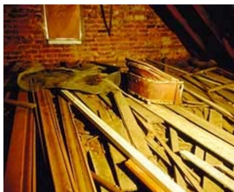
Discarded items are routinely stored within attics, then forgotten only to be discovered during a later investigation. Seemingly worthless debris may help answer many questions.

Basements generally relate more to human service functions in earlier buildings and to mechanical services in more recent eras. For example, a cellar of an urban 1812 house disclosed the following information during an investigation: first period bell system, identification of a servant's hall, hidden fireplace, displacement of the service stairs,