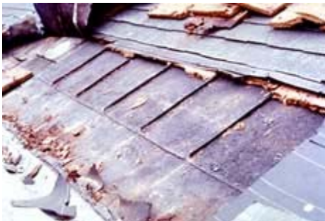
In many cases, new materials or coverings are placed directly over existing exterior features, preserving the original materials underneath. Here, the removal of a modern shingle roof and its underlayment revealed an historic standing seam metal roof.

Roofs. Exterior features are especially prone to alteration due to weathering and lack of maintenance. Even in the best preserved structures, the exterior often consists of replaced or repaired roofing parts. Roof coverings typically last no more than fifty years. Are several generations of roof coverings still in place? Can the layers be identified? If earlier coverings were removed, the sheathing boards frequently provide clues to the type of covering as well as missing roof features. Dormers, cupolas, finials, cresting, weathervanes, gutters, lightning rods, skylights, balustrades, parapets and platforms come and go as taste, function and maintenance dictate. The roof pitch itself can be a clue to stylistic dating and is unlikely to change unless the entire roof has been rebuilt. Chimneys might hold clues to original roof pitch, flashings, and roof feature attachments. Is it