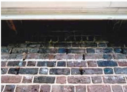
Careful examination of the masonry reveals different periods of construction and repair through the composition and detailing of bricks and mortar. Depending on location, the vertical open joints may indicate the location of nailing blocks for decorative trim or weeps for drainage.

Although brick or wood frame buildings are the most common in this country, similar sets of characteristics and questions can be established for examining log, adobe, steel, or any other material.