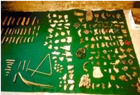
An inventory of animal nests found within hidden spaces may yield unexpected evidence about food, decorative arts, and cultural or social traditions of everyday life.

Historical research should be conducted well in advance of physical investigation. This allows time for important written, visual, and oral information to be located, transcribed, organized, studied and used for planning the actual work.