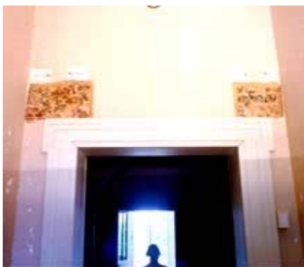
Destructive investigation can be limited to small areas where evidence can be predicted, such as walls being re-built in a different location.

floor cloths, and applied floor finishes. Is there a pattern of tack holes? Tacks or tack holes often indicate the position and even the type of a floor covering. A thorough understanding of the seasonal uses of floor coverings and the technological history of their manufacture provide the background for identifying this type of evidence.