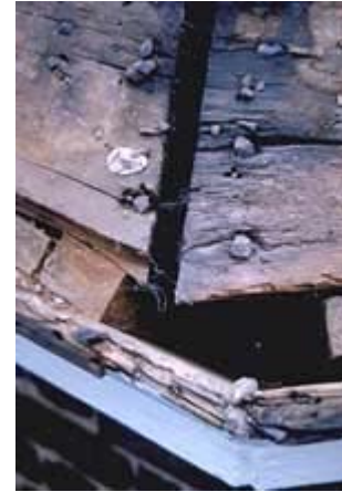
Analyzing the nail technology can help establish the period of construction and provide other important information.

Wood. Buildings constructed with wood have a very different set of characteristics, requiring a different line of questioning. Is the wooden structural system log, timber frame, or balloon frame construction? Evidence seen on the wood surface indicates whether production was by ax, adze, pit saw, mill saw (sash or circular), or band saw. What are the varying dimensions of the lumber used? Finished parts can be sawn, gouged, carved, or planed (by hand or by machine). Were they fastened by notching, mortise and tenon, pegs, or nailing? If nails were used, were they wrought by hand, machine cut with wrought heads, entirely machine cut, or machine wire nails? For much of the nineteenth century the manufacture of nails underwent a series of changes and improvements that are dateable, allowing nails to be used as a tool in establishing periods of construction and alteration. Regardless of region or era, the method of framing, joining and finishing a wooden structure will divulge something about the original construction, its alterations, and the practices of its builders. Finally, does some of the wood appear to be re-used or re-cycled? Re-used and reproduction materials used in early restoration projects have confused many investigators. When no identification record was kept, it can be a problem distinguishing between materials original to the house and later replacement materials.