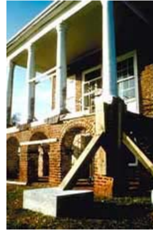
Investigation frequently identifies urgent needs of stabilization. Supplemental support, such as temporary shoring, may be required to prevent collapse.

Architectural survey and comparative fieldwork provides a crucial database for studying regional variations in historic buildings. For example, construction practices can reflect shared experiences of widely diverse backgrounds and traditions within a small geographical area. Contemporary construction practice in an urban area might vary dramatically from that of rural areas in the same region. Neighbors or builders within the same small geographical area often practice different techniques of constructing similar types of structures contemporaneously. Reliable dating clues for a certain brick bond used in one state might be unreliable for the same period in a different state. Regional variation holds true for building materials as well as construction.