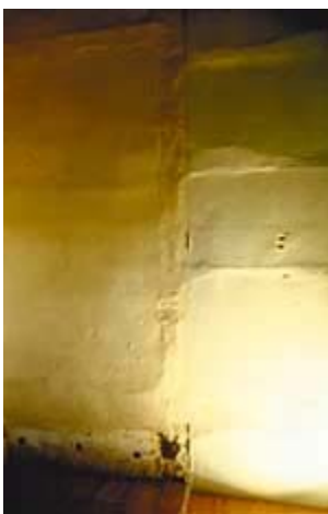
Raking light is used to show irregularities on flat surfaces. Patches, repairs, and alterations can then be mapped by the shadows or ghosts they cast.

Reconnaissance. An initial reconnaissance trip through a structure-or visual overview-provides the most limited type of investigation. But experienced investigators accustomed to observation and analysis can resolve many questions in a two-to-four hour preliminary site visit. They may be able to determine the consistency of the building's original form and details as well as major changes made over time.