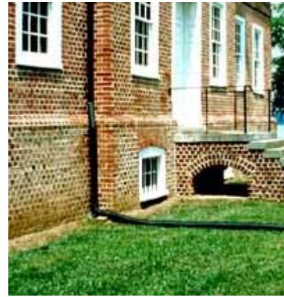
The owner used long black extender pipes to test a theory that it was faulty roof drainage causing the problem.

Does the moisture problem appear to be intermittent, chronic, or tied to specific events? Are damp conditions occurring within two hours of a heavy rain or is there a delayed reaction? Does rust on most nail heads in the attic indicate a condensation problem? What are the wet patterns that appear on a building wall during and after a rain storm? Is it localized or in large areas? Can these rain patterns be tied to gutter overflows, faulty flashing, or saturation of absorbent materials? Is a repaired area holding up well over time or is there evidence that moisture is returning? Do moisture meter readings of wall cavities indicate they are wet, suggesting leaks or condensation in the wall?