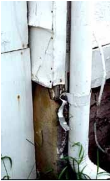
A clogged or broken downspout causes the water to pour directly into the ground. NPS files. Photo: NPS files.

modern source of ground moisture is a landscape irrigation system set too close to the building. Incorrect placement of sprinkler heads can add a tremendous amount of moisture at the foundation level and on wall surfaces.