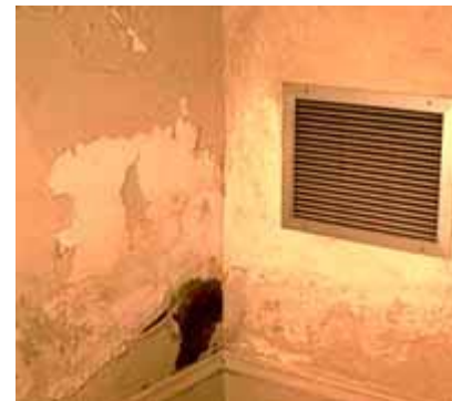
If adequate ventilation is installed, damage to interior walls such as this can be prevented. NPS files. Photo: NPS files.

Humidified climate control systems are generally a major problem in museums housed within historic buildings. They produce between 35%-55% RH on average which, as a vapor, will seek to dissipate and equalize with adjacent spaces. Moisture can form on single-glazed windows in winter with exterior temperatures below 30° F and interior temperatures at 70°F with as little as 35% RH. Frequent condensation on interior window surfaces is an indication that moisture is migrating into exterior walls, which can cause long-term damage to historic materials. Materials and wall systems around climate controlled areas may need to be made of moisture resistant finishes in order to handle the additional moisture in the air. Moist interior conditions in