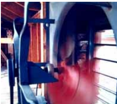
Installing ventilating fans can improve damp conditions or reduce cooling loads.

Exterior: Apply cyclical maintenance procedures to eliminate rain and moisture infiltration.