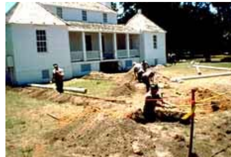
New drainage systems for roof run-off may be installed in order to remove moisture from the base of the building.

Roofing: Repair roofing, parapets and overhangs that have allowed moisture to enter; add ice and water shield membrane to lower 3-4 feet of roofing in cold climates to limit damage from ice dams; increase attic ventilation, if heat and humidity build-up is a problem. Make gutters slope @ 1/8" to the foot. Use professional handbooks to size gutters and reposition, if necessary and appropriate to historic architecture. Add ventilated chimney caps to unused chimneys that collect rain water.