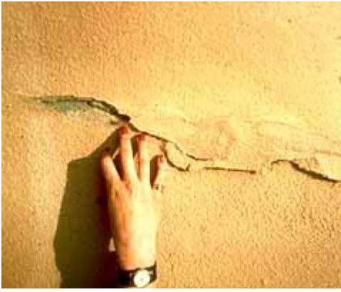
Applying a waterproof coating to an above-ground masonry wall can trap moisture underneath, causing further damage to the historic material.

effective drainage of troublesome ground moisture, and improved interior ventilation.