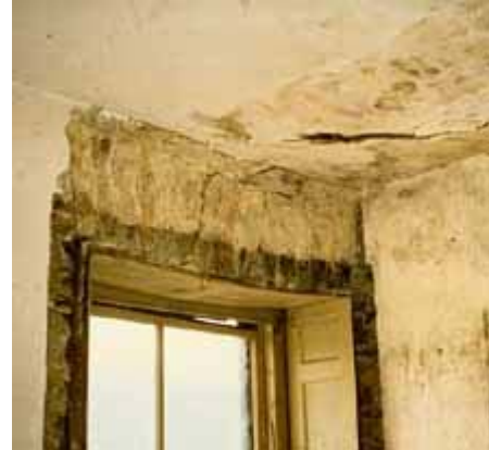
Damp interior plaster around windows generally indicates moisture has entered from the outside.

Above grade exterior moisture generally results from weather related moisture entering through deteriorating materials as a result of deferred maintenance, structural settlement cracks, or damage from high winds or storms. Such sources as faulty roofs, cracks in walls, and open joints around window and door openings can be corrected through either repair or limited replacement. Due to their age, historic buildings are notoriously "drafty," allowing rain, wind, and damp air to enter through missing mortar joints; around cracks in windows, doors, and wood siding; and into uninsulated attics. In some cases, excessively absorbent materials, such as soft sandstone, become saturated from rain or gutter overflows, and can allow moisture to dampen interior surfaces. Vines or other vegetative materials allowed to grow directly on building materials without trellis or other framework can cause damage from roots eroding mortar joints and foundations as well as dampness being held against surfaces. In most cases, keeping vegetation off buildings, repairing damaged materials, replacing flashings, rehangng gutters, repairing downspouts, repointing mortar, caulking perimeter joints around windows and doors, and repainting surfaces can alleviate most sources of unwanted exterior moisture from entering a building above grade.