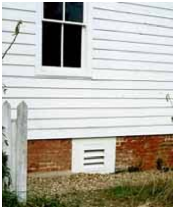
A vent may be added if there is none. Close grilles in the summer, if hot humid air is getting into air conditioned spaces.

Interior: Maintain equipment to reduce leaks and interior moisture.