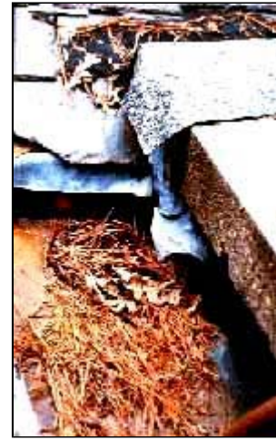
Debris will impede the normal flow of water from the roof's gutter and downspout system to the ground and result in moisture problems.

Diagnosing and treating the cause of moisture problems requires looking at both the localized decay, as well as understanding the performance of the entire building and site. Moisture is notorious for traveling far from the source, and moisture movement within concealed areas of the building construction make accurate diagnosis of the source and path difficult. Obvious deficiencies, such as broken pipes, clogged gutters, or cracked walls that contribute to moisture damage, should always be corrected promptly. For more complicated problems, it may take several months or up to four seasons of monitoring and evaluation to complete a full diagnosis. Rushing to a solution without adequate documentation can often result in the unnecessary removal of historic materials-and worse-the creation of long-term problems associated with an increase, rather than a decrease, in the unwanted moisture.