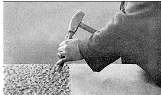
Historically, a point finish was put on with a single pointed chisel.

High quality cast stone was frequently "cut" or tooled with pneumatic chisels and hammers similar to those used to cut natural stone. In some cases, rows of small masonry blades were used to create shallow parallel grooves similar to lineal chisel marks. The results were often strikingly similar in appearance to natural stone. Machine and hand tooling was expensive, however, and simple molded cut cast stone was sometimes only slightly less costly than similar work in limestone. Significant savings could be achieved over the cost of natural stone when repetitive units of ornate carved trim were required.