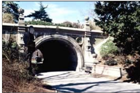
Constructed in 1868 of Beton Coignet, the Cleft Ridge Span in New York City's Prospect Park is one of the earliest extant cast stone structures in the United States.