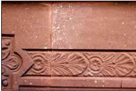
Unlike natural stone, cast stone generally may not be tooled in place to reduce lippage of uneven surfaces at joints. Tooling often exposes coarse aggregate from below the surface.

While re-tooling of deteriorated natural stone may sometimes be appropriate, restoring the original appearance of cast stone where surface erosion has occurred is difficult or impossible.