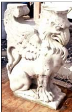
After removal from the

Individual cast stone units, which are subject to repeated wetting (such as copings, railings and balusters) and exhibit severe failure due to spalling or reinforcement deterioration, may require replacement with new cast stone and can replicate deteriorated units in existing buildings.