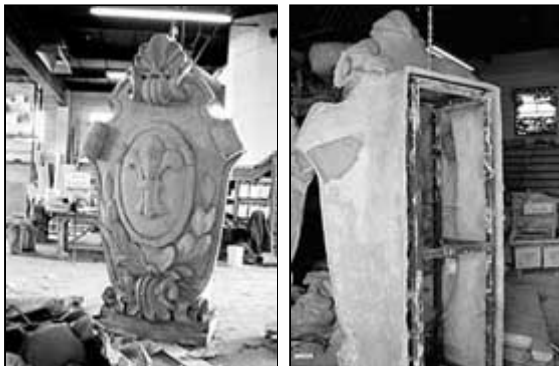
GFRC is sometimes used to replicate deteriorated elements of cast or fine grained natural stone. Because the GFRC element is a rigid, but relatively thin shell, it must be supported and attached with an interior

Glass fiber reinforced concrete (GFRC) is more and more frequently encountered in building restoration and is used to replicate deteriorated stone and cast stone, and even architectural terra cotta. This is a relatively new material that uses short chopped strands of glass fiber to reinforce a matrix of sand and cement. GFRC has become a popular low cost alternative to traditional precast concrete or stone masonry for some applications. Fabricators use a spray gun to spray the mortar-like mix into a mold of the shape desired. The resulting concrete unit, typically only \frac{3}{4} " thick, is quite rigid, but requires a metal frame or armature to secure it to the building substrate. The metal frame is joined to the GFRC unit with small "bonding pads" of GFRC.