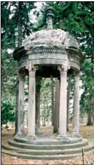
Scaling of cast stone units signals problems with the cementing mix and method of manufacture. Serious deterioration of cast stone, such as this, warrants replacement.

While it is relatively uncommon in twentieth century cast stone, serious deterioration of the cementing matrix can cause extensive damage to cast stone units. A properly prepared cementing mix will be durable in most exterior applications, and any flaking of exterior surfaces signals problems in the cementing mix and in the method of manufacture. The use of poor quality or improperly stored cement, impure water, or set accelerators can cause cement problems to occur years after a structure is completed. Improper mixing and compaction can also result in a porous concrete that is susceptible to frost damage and scaling. Severe cement matrix problems may be impossible to repair properly and often necessitate replacement of the deteriorating cast stone units.