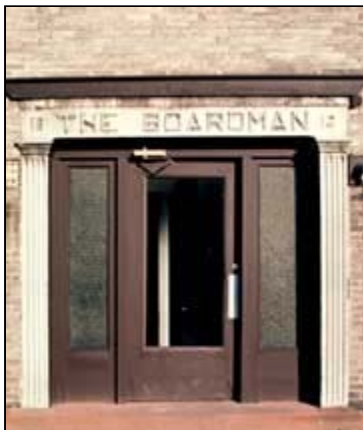
Cast stone was commonly used for molded trim in conjunction with brick or natural stone. This brick building in Rochester, New York, uses cast stone for the entry surround, and natural stone for unornamented windows sills, thresholds, and water table units.

The use of cast stone grew rapidly with the extraordinary development of the portland cement and concrete industries at the end of the 19th century. In the early decades of the 20th century, cast stone became widely accepted as an economical substitute for natural stone. It was sometimes used as the only exterior facing material for a building, but was more often used as trim on a rock-faced natural stone or brick wall.