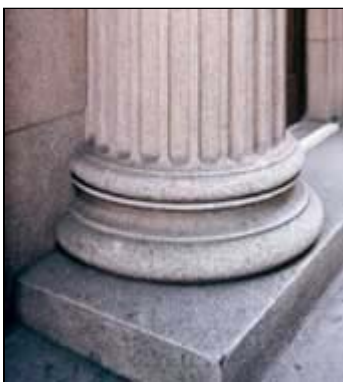
For this column, the appearance of a "pink granite" was simulated by using a pinkish matrix with white and black aggregate. Erosion of a tinted matrix results in a significant lightening of the cast stone surface.

Finally, cast stone is sometimes today used to replace natural stone when the original historic stone is no longer available, or the greater strength of reinforced concrete is desired. Reinforced cast stone columns, for instance, are frequently used to replace natural stone columns in seismic retrofits of historic structures. Fine-grained stones, such as sandstones, may be very successfully replicated with cast stone. Coarse-grained granites and marbles with pronounced patterns or banding are, for obvious reasons, not so successfully matched with cast stone. The replacement of natural stone with cast stone requires careful attention to selection of fine aggregates and the pigmentation of the cementing matrix. Coarse aggregate, which is generally used in cast stone to control shrinkage and assure adequate compressive strength, can present an aesthetic problem if it is visible at the surface of cast stone elements which simulate sandstone. Careful control of aggregate sizes in the mix formulation can reduce this problem.