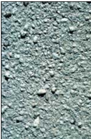
Sandblasting and wet grit blasting can seriously erode the surface and should not be used to clean cast stone surfaces.

Cast stone installations with marble or limestone aggregates may sometimes be cleaned with the same alkaline pre-wash/acid afterwash chemical cleaning systems used to clean limestone and other calcareous natural stones. If no marble or limestone aggregates are present, acidic cleaners, such as those used for natural granites and sandstones, may be used.