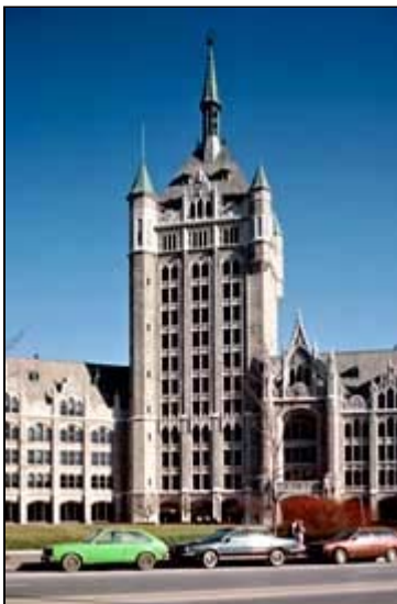
The prominent Delaware and Hudson Building, Albany, New

The practice of using cheaper and more common materials on building exteriors in imitation of more expensive natural materials is by no means a new one. In the eighteenth century, sand impregnated paint was applied to wood to look like quarried stone. Stucco scored to simulate stone ashlar could fool the eye as well. In the 19th century, cast iron was also often detailed to appear like stone. Another such imitative building material was "cast stone" or, more precisely, precast concrete building units.