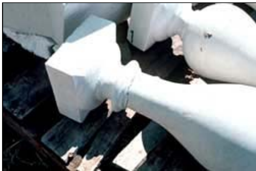
Surface cracking may reduce the durability of cast stone units. Cracking is often problematic on reinforced elements with thin "necks," such as balusters, unless curing is carefully controlled.

Aggregate segregation. Cast stone formulations generally include a range of coarse aggregates (crushed stone) and fine aggregates (sand). When units are vibrated to assure compaction of the mix and liberate trapped air bubbles, coarse aggregates may begin to settle and separate from the paste of cement and sand. Aggregate segregation results in a visible concentration of coarse aggregate at one end of the casting. Segregation is more problematic when end casting long pieces such as columns.