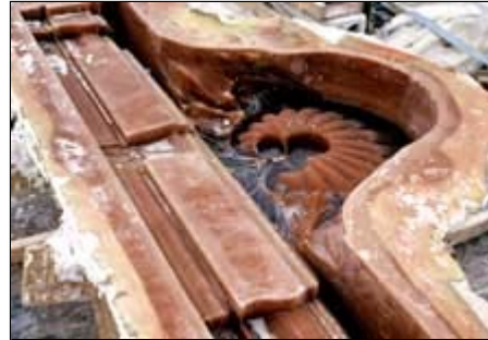
Production molds made of durable rubbers backed with wood and plaster supports are used to fabricate new cast stone.

Surface finishing. Post-fabrication surface tooling of new cast stone is not currently common. Sandblasting is typically used to remove the surface film of cement and expose the aggregate. For replacement units replicating historic cast stone pieces in highly visible locations, it is sometimes possible to make a mold of a sound or repaired existing piece to incorporate the original tooling in the casting process. If the historic unit is too deteriorated to use as a pattern, a plaster model may be made to replicate the damaged piece. This is tooled to replicate the desired surface treatment or appearance, and a production mold is then made from the plaster model.