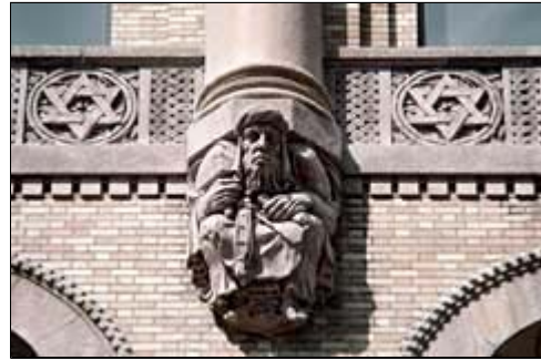
Sculptural ornament was frequently produced in cast stone. Repetitive detail, such as these banding course panels on the Level Club in New York City (1926), were produced much more economically than they could be in natural stone.

Having gained popularity in the United States in the 1860s, cast stone had become widely accepted as an economical substitute for natural stone by the early decades of the 20th century. Now, it is considered an important historic material in its own right with unique deterioration problems that require traditional, as well as innovative solutions. This Preservation Brief discusses in detail the maintenance and repair of historic cast stone—precast concrete building units that simulate natural stone. It also covers the conditions that warrant replacement of historic cast stone with appropriate contemporary concrete products and provides guidance on their replication. Many of the issues and techniques discussed here are relevant to the repair and replacement of other precast concrete products, as well.