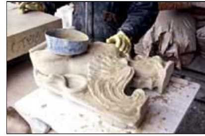
The holes on the surface of the casting (see above, left) are being filled with a mortar similar to the concrete mix used to cast the element.

Reinforcement. The alkalinity of new concrete generally provides adequate protection