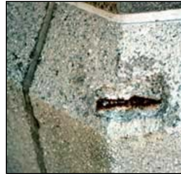
Rusting of reinforcement near the surface of the stone may result in spalling. Sections of reinforcement, such as this, may be cut out and the spall repaired with a matching composite mortar.

During their original manufacture, unusually long and thin cast stone units, such as window sills or balustrade railings, and units requiring structural capacity, such as lintels, were generally reinforced with mild steel reinforcing bars. Large pieces sometimes had cable loops or hooks cast into them to facilitate handling and attachment. On occasion, this reinforcement and wire may be too close (less than 2") to the surface of the piece and rusting will cause spalling of the surface. This frequently happens to sills, copings, and water tables where repeated heavy wetting leads to loss of alkalinity in the concrete, allowing the reinforcement to rust. If damage from the deteriorating reinforcement is extensive, as for instance, the splitting of a baluster from the rusting of a central reinforcing rod, the cast stone unit may require replacement.