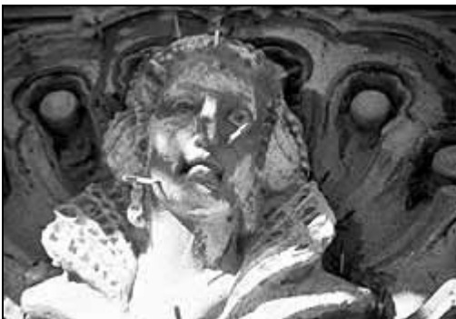
A delaminated layer of ornamental cast stone on the Orpheum Theater, San Francisco, California (1925), was successfully re-attached using epoxy. The multiple delivery ports for the epoxy are removed after treatment and the holes

The weathering of cast stone, while different from that of natural stone, produces a patina of age, and does not warrant large-scale replacement, unless severe cement matrix problems or rusting reinforcement bars have caused extensive scaling or spalling. Severe rusting of reinforcement bars on small decorative features, such as balusters, may signal carbonation (loss of alkalinity) of the matrix. Where carbonation of the matrix has occurred, untreated reinforcement will continue to rust. Replacement may be an acceptable approach for exposed and severely deteriorated features, such as hand railings, roof balustrades, or wall copings, where disassembly is unlikely to damage adjacent construction. Conversely, small areas of damage should generally be repaired with mortar "composites," or left alone.