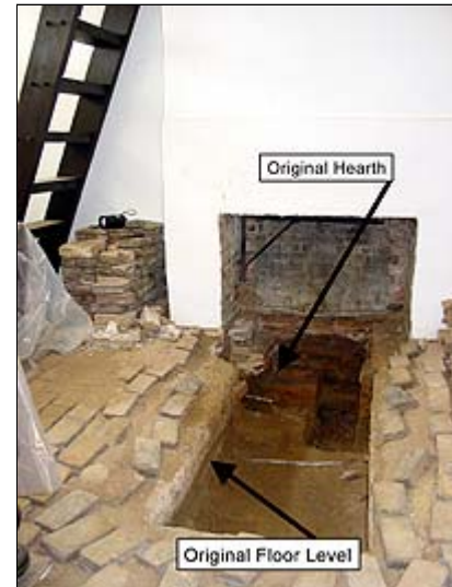
Archeological studies may be valuable in uncovering important evidence of changes to a historic structure. Following historical research and after several archeological soil probes, a decision was made to excavate an area in front of a mid-nineteenth century fireplace, revealing the original dirt floor and hearth undetected by earlier restoration efforts.

Measured drawings and record photography. The collection of the Historic American Building Survey/Historic American Engineering Record (HABS/HAER) archive at the Library of Congress should be searched in case the property has been previously documented through drawings and photographs. While many historic properties have been documented since the start of this invaluable collection in the 1930s, it is still more likely that this type of documentation does not exist for a property for which a historic structure report is being undertaken. Preparation of such documentation to portray the current condition of a property can be an invaluable addition to the historic structure report. Besides serving as a documentary record of a structure, the recording documents can serve another purpose such as an easement document, information for catastrophic loss protection, interpretive drawings, or baseline drawings for proposed work. If undertaken as part of the current building study, the measured drawings and record photography should follow the Secretary of the Interior's Standards and Guidelines for Architectural and Engineering Documentation .