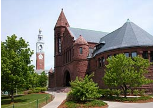
The University of Vermont has more than thirty contributing buildings in four historic districts listed in the National Register of Historic Places. The Campus Master Plan recognizes a commitment to respect and maintain the historic integrity of these facilities. Historic structure reports are available for many of the University's historic structures.

interior of the Stanley Field Hall, Field Museum, Chicago.