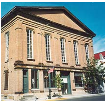
At the Hudson Opera House, a multi-arts center in Hudson, New York, the historic structure report was prepared incrementally. The first phase of the report focused on assessment and recommendations for repair of the roofing, the most critical issue in preservation of the building.

The length of time required to prepare a historic structure report and the budget established for its development will vary, depending on the complexity of the project, the extent and availability of archival documentation, and to what extent work has already been performed on the building. If the scope of a historic structure report for a simple building is limited to a brief overview of historic significance, a walk-through condition assessment, and general treatment, the study and report may be completed within a few months' time by an experienced investigator. On the other hand, a historic structure report for a larger building with numerous past alterations and substantive problems will require extensive research and on-site study by a multidisciplinary team. This type of report can often take up to two years to complete.