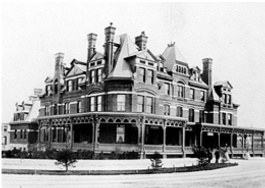
The historic structure report for the Hotel

In addition to project goals, the proposed work is also guided by the building's condition. The scope of recommended work may range from minor repairs to structural stabilization to extensive restoration. In addition, the scope of work may be very narrow (e.g., priming and painting of woodwork and repair of deteriorated roof flashings), or very extensive (e.g., stabilization of timber framing or major repair and repointing of exterior masonry walls). The result of implementing (or not implementing) the recommended work needs to be considered as the recommendations are developed.