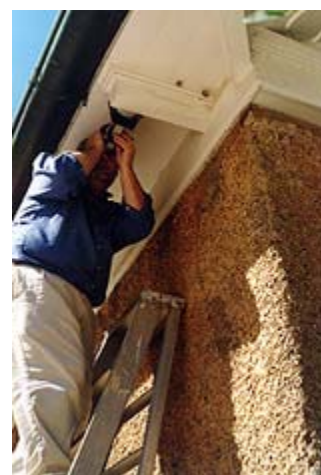
Paint studies may not only help establish the chronology of paints and paint colors used on a building but also may aid in the dating of existing architectural features. Examination of the paint layers on these modillions utilizing a hand-held microscope enabled an investigating team to confirm in the field which modillions were original and which were later replacements.

All of the information gathered during the physical investigation, and through field testing and laboratory analysis, should be documented in field notes, sketches, photographs, and test reports. This information is incorporated in the historic structure report and provides a basis for the development of treatment recommendations.