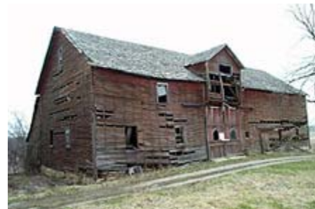
For small or simple projects, the project team may include only one or two specialists while complex projects may involve a large number of investigators and specialists. Evaluation of this barn may primarily involve an historian, an architectural conservator, and a structural engineer.

The disciplines involved in a specific historic structure report reflect the key areas or issues to be addressed for the particular property. The project leader or designated principal author for the report is responsible for coordinating and integrating the information generated by the various disciplines. Designation of a principal author may depend on the goals of the historic structure report and on which disciplines are emphasized in the study.