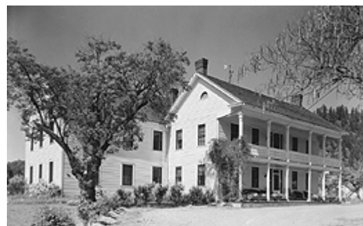
The treatment approach selected for a building usually is determined by the intended use of a property, funding prospects, and the findings of an investigation. The Wolf Creek Inn, operated

Selection of a treatment approach. Once the building's history, significance, and physical condition have been researched and investigated, an appropriate treatment is usually selected. Depending upon the intended use of a property, funding prospects, and the findings of the investigation, it may be necessary in some cases to identify and discuss an alternate treatment as well. For example, a building currently occupied by caretakers that is a candidate for restoration and use as a museum may require such ambitious funding support that, for the foreseeable future, a more practical treatment could be to preserve the building and retain the caretakers. In this case, the