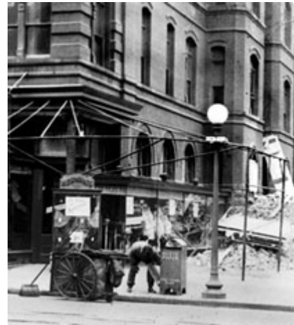
During the second half of the 19th century, iron plumbing pipe became a popular material for fixed awning frames. Here, a pipe frame without its canvas cover extends around the corner of a building in Washington, D.C.

Operable Awnings. In the second half of the 19th century, manufactured operable awnings grew in popularity. Previously, most awnings had fixed frames—the primary way to retract the covering was to roll it up the rafters by hand. Operable systems for both storefront and window awnings had extension arms that were hinged where they joined the facade. The arms were lowered to project the awning or raised to retract the awning using simple rope and pulley arrangements. Because the canvas remained attached to the framework, retractable awnings allowed a more flexible approach to shading—shopkeepers and owners could incrementally adjust the amount of awning coverage depending upon the weather conditions. When the sun came out from behind clouds, the awning could be deployed with ease. In case of sudden storms, owners could quickly retract the awning against the building wall where it was protected from wind gusts.