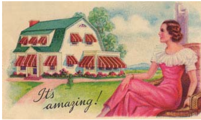
Awnings were an easy way to dress up and distinguish homes of virtually any style. Image: Otis Awning Fabrics Company brochure, c. 1920s.

rediscovered awnings. Local "main street" preservation programs encouraging-and in some cases funding-rehabilitation work have helped spur the awning's return. Continued concerns over energy efficiency have also persuaded building owners and developers to use awnings to reduce heat gain, glare, and cooling costs. Because awnings were so common until the mid-twentieth century, they are visually appropriate for many historic buildings, unlike some other means of energy conservation.