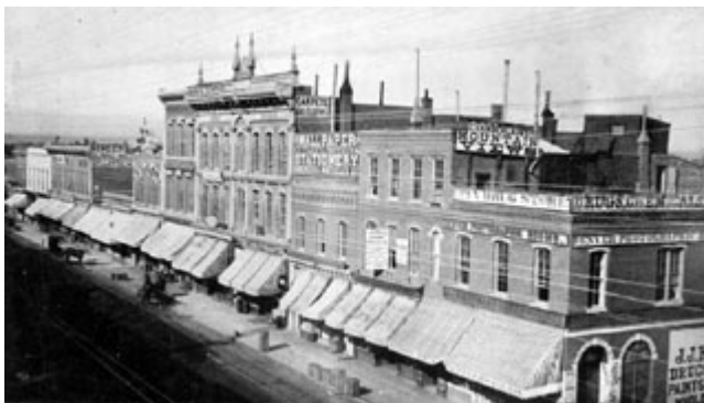
Storefront awnings over sidewalks and entrances were typical features of American streetscapes for much of the 19th and 20th centuries. Photo of Larimer Street, Denver, Colorado, c. 1870, Denver Public Library, Western History Collection, x-22058.

A shopkeeper rolls out an awning at the beginning of the workday; a family gathers under a porch awning on a late summer afternoon. These are familiar and compelling images of earlier urban and residential life in America. For two centuries, awnings not only played an important functional role, they helped define the visual character of our streetscapes. Yet, compared to historic photographs of downtowns and neighborhoods with myriad awnings, today's streets often seem plain and colorless.