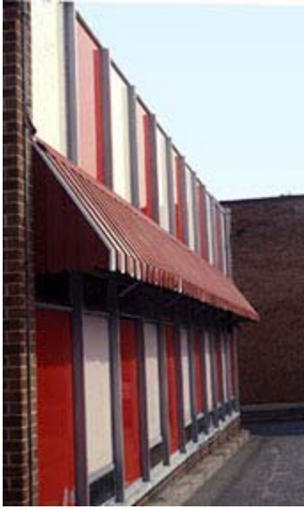
This 1950s-era dry cleaner has an aluminum awning that, with its vertical pattern and alternating stripes, complements the facade's porcelain enamel panels and aluminum mullions. The awning forms an essential element of the building's historic character.

If awnings already exist on a historic building, they should be evaluated to determine whether they are appropriate to the age, style, and scale of the building, using the criteria identified below. Backlit awnings and dome awnings are usually inappropriate for 19th century and other historic buildings, while aluminum awnings may be perfectly compatible with buildings from the 1950 or 60s. The time is approaching when some aluminum awnings may even be considered appropriate to older buildings, if the awnings formed part of an updated storefront, or are central features of an intact postwar refashioning of the building's exterior.