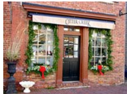
Appropriate lettering, as on this roller awning valance, can function as distinctive signage without detracting from the historic character of the building.

Signage. In addition to sheltering shoppers and merchandise, and reducing glare and temperatures, awnings on commercial buildings offer valuable advertising space. Photographs from the mid-19th century show a wide range of lettering and logos-business names, types of trade (hosiery shop, telegraph house), street numbers-on the sloped coverings and side flaps of awnings. The most common placement of a shop proprietor's business name or service was on the valance hanging down from the awning edge. The front valance provided a flat surface visible whether the awning was retracted against the building wall or fully extended. Many establishments, however, left their awnings unadorned without any lettering.