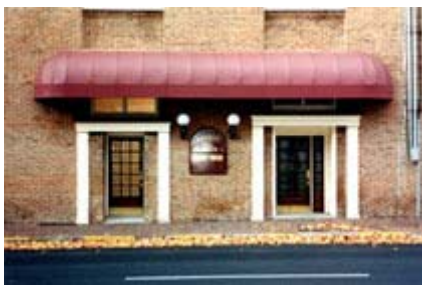
Single awnings should not be set over more than one door or window bay. A separate shed awning with a canvas or acrylic covering would be more appropriate over each of these openings.

Likewise, staple-in systems are not recommended for historic buildings. One of the distinctive features of a staple-in system is an exceptionally taut and wrinkle-free appearance; indeed, this is a chief appeal of the system when applied to new construction. Historic awnings, however, were either retractable or built with a covering laced onto a frame. Both forms had a fair amount of give in the fabric. Staple systems, especially those with long valances, usually present an appearance more suited to newer construction. While not recommended for installation on most historic buildings, they may be appropriate for infill construction within a historic district.