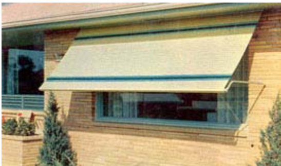
The years after World War II saw the widespread adoption of aluminum awnings on

Widely available by the 1950s, aluminum awnings were touted as longer-lasting and lower-maintenance than traditional awnings. Though used on small-scale commercial structures, they were especially popular with homeowners. Aluminum awnings were made with slats called "pans" arranged horizontally or vertically. For variety and to match the building to which they were applied, different colored slats could be arranged to create stripes or other decorative patterns. While aluminum awnings were usually fixed, in the 1960s several operable roller awnings were developed, including one with the trade name Flexalum Roll-Up.