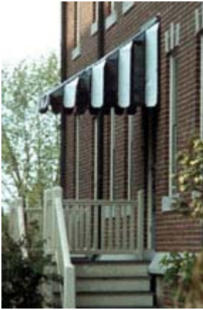
This postwar aluminum awning does not contribute to the character of this 19th century residence and could be replaced during a rehabilitation project with a fabric shed awning more in keeping with the building's age and appearance.

ensure that the covering not obscure the building's distinctive architectural features.