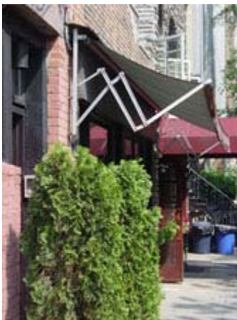
Scissor arm awnings have a pair of vertical, hinged arms on either side of the assembly supporting the front bar. To unfurl the awning, the roller is cranked and the arms extend outward

Awning development during the early twentieth century focused on improving operability. Variations in roller awnings addressed the need to provide an increasingly customized product that accommodated a wide range of storefront configurations and styles.