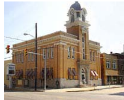
Using the historic photos as a guide (see photo, above, left), new awnings with a similar shape and stripe pattern were installed increasing the comfort of employees and protecting county records from direct sunlight.

Where no awning currently exists, and there is no evidence of a past one, it may still be possible to add an awning to a historic building without altering distinctive features, damaging historic fabric or changing the building's historic character. A new awning should be compatible with the features and characteristics of a historic building, as well as with neighboring buildings, or the historic district, if applicable. Historic photographs of similar neighboring buildings with awnings, can also be helpful in choosing an appropriate installation. When selecting and installing a new awning, a number of other factors should be considered: shape, scale, massing, placement, signage, and color.