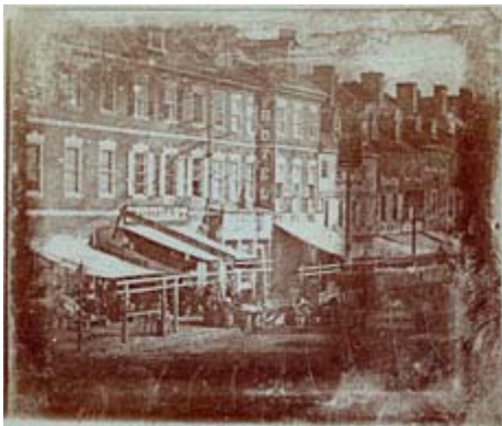
Early 19th century awnings featured canvas coverings stretched between the building facade and post-supported front bars. Projecting frameworks of extension bars were not common until later in the century. Photo: Second Street, Philadelphia, c. 1841, Print and Photo Collection, The Free Library of Philadelphia.

Awnings are remarkable building features that have changed little over the course of history. Records dating back to ancient Egypt and Syria make note of woven mats that shaded market stalls and homes. In the Roman Empire, large retractable fabric awnings sheltered the seating areas of amphitheatres and stadiums, including the Coliseum. The Roman poet Lucretius, in 50 B.C., likened thunder to the sound that "linen-awning, stretched, o'er mighty theatres, gives forth at times, a cracking roar, when much 'tis beaten about, betwixt the poles and cross-beams." Over the next two millennia awnings appeared throughout the world, while the technology used in their construction changed little.