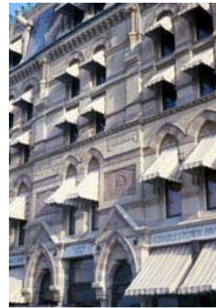
These window awnings today match what would have appeared in the 19th century. The fabric is slightly loose on the frames, the valances hang freely, each window bay has its own awning, and the awning frames are set within the openings.

Today creating large lettered signs on a new awning as part of a rehabilitation project requires special care and is not appropriate in all cases. Used long before any local signage control, historic examples of such lettering often reflected the character of a district, with more upscale retail areas, for example, being more reserved than wholesale districts. Contemporary awning lettering can add visual interest and commercial identity but should be designed in keeping with the historic character of a building and its historic district.