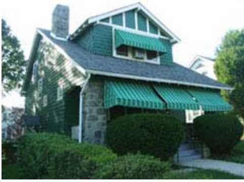
Simple shed-type awnings with acrylic or canvas coverings and free-hanging valances are appropriate for most historic residences featuring rectilinear openings.

New awning shapes appeared in the later 19th century to accommodate the expanding variety of door and window configurations. Casement window awnings were box-like in shape to accommodate the outward swing of the vertical sash. Window openings with arched tops, such as those found on Italianate houses and commercial buildings, were often shaded by awnings with matching tops.