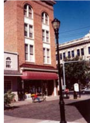
A dome awning was an inappropriate addition to this circa 1890s building. In order to qualify for historic tax credits the new vinyl awning was replaced with a shed awning with a canvas-like woven acrylic covering.

(and in some historic districts, required) that these awnings have free-hanging valances, the flapping bottom pieces so characteristic of historic awnings. Quarter-round awnings, modern mansard awnings, and other contemporary commercial designs with distended, fixed valances have no precedent in traditional awning design and are usually inappropriate for historic buildings.