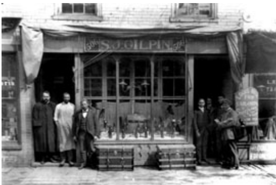
A 19th century shoe store in Richmond, Virginia had an operable awning retracted against the building facade. Hinged extension arms were raised and lowered allowing for an awning configuration easily changed in response to weather conditions. This photo shows how the fabric gathered and was exposed to the elements when retracted - part of the reason roller awnings later became prevalent.

But the early operable awnings had their own drawbacks. When retracted, the coverings on early operable awnings bunched up against the building facade where it was still partially exposed to inclement weather. (In fact, deterioration was often accelerated as moisture pooled in the fabric folds.) Also, the retracted fabric often obscured a portion of the window or door opening and unless it was folded carefully, presented an unkempt appearance.