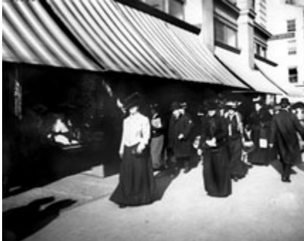
A wide selection of striped patterns took the awning beyond its original, utilitarian function to serve as a decorative and appealing building feature.

Shapes and Stripes. An expanded variety of available canvas colors, patterns, and valance shapes also appeared during this period. Some coverings were dyed a solid color; shades of slate, tan, and green were especially popular. Others had painted stripes on the upper surface of the canvas. Awning companies developed a colorful vocabulary of awning stripes that enhanced the decorative schemes of buildings, and in some cases, served as a building's primary decorative feature.