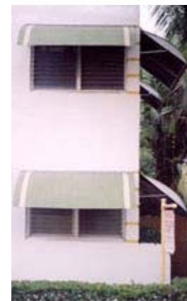
These fiberglass "clamshell" awnings, although not as old as the 1930s building to which they were affixed, are important features that have acquired significance. They were retained when the building was recently rehabilitated. Photo:

Regular cleaning will lengthen the lifespan of any awning. About once a month the covering should be hosed down with clean water. Choose a sunny day so that the fabric dries quickly and thoroughly.