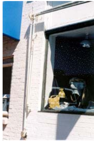
A gearbox, slide rod, roller, front bar, and extension arm reveal that this 19th century facade once featured a retractable awning. It is likely that with minor repairs the surviving hardware could again be made operable, recovered with a canvas or acrylic fabric, and reused to service the storefront.

Storefront remodeling projects often uncover concealed and disused awning hardware that can either be repaired or at least suggest what type of awning was formerly in place. This is especially true for awnings that had an operating rod, gearboxes, and perhaps motors concealed in recesses within the building wall. Protected from the elements, these items are likely to survive in repairable condition. Sometimes physical evidence of earlier awnings can be found in the basement or upper floors where hardware and even old coverings may have been stored after being removed from the facade. Clamps, fasteners, and bolt holes in an exterior wall can reveal the position, type and dimensions of a missing awning installation. Fittings or other marks on the side of the entrance or windows, for example, suggest that a fixed-arm awning was present rather than a lateral-arm awning. Gearboxes point to a retractable rather than a fixed awning.