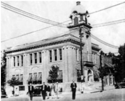
When the county clerk in Morgan County, West Virginia was looking to reduce glare in the courthouse offices she located a 1940s photo showing sets of awnings on the first floor.

Historic photographs and drawings are a primary documentary resource used to determine an earlier awning configuration. Photographs have the added