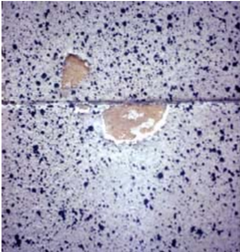
Blistering of the glaze, like crazing, is the result of the increase in water in the porous clay body and the subsequent destruction of the glaze as a result of water migration and pressure. Glaze spalling may also be caused by deterioration of metal anchors behind the terra-cotta unit.

and is usually a result not only of airborne water but more commonly of water trapped within the masonry system itself. Trapped water is often caused by poor water detailing in the original design, insufficient maintenance, rising damp or a leaking roof. In most cases, trapped water tends to migrate outward through masonry walls where it eventually evaporates. In glazed architectural terra-cotta, the water is impeded in its journey by the relatively impervious glaze on the surface of the unit which acts as a water barrier. The water is stopped at the glaze until it builds up sufficient pressure (particularly in the presence of widely fluctuating temperatures) to pop off sections of the glaze (glaze spalling) or to cause the wholesale destruction of portions of the glazed architectural terra-cotta unit itself (material spalling).