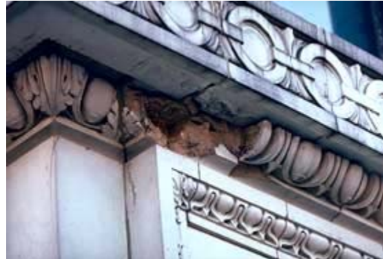
Material spalling is the result of excessive expansion of the porous tile body caused by water and freezing temperatures. This is a serious condition, often difficult to repair.

Tapping , a somewhat inexact method of detection of internal deterioration is, nevertheless, the most reliable inspection procedure presently available. Quite simply, tapping is the striking of each unit with a wooden mallet. When struck, an undamaged glazed architectural terra-cotta unit gives a pronounced ring, indicating its sound internal condition. Conversely, deteriorated units (i.e., units which are failing internally) produce a flat, hollow sound. Metal hammers are never to be used, as they may damage the glazed surface of the unit. Extensive experience is the best teacher with this inspection method.