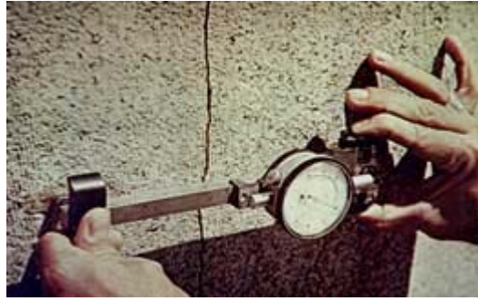
This crack is being measured. Structural cracking, whether static (nonmoving) or dynamic (moving) should be caulked to prevent water entry into the glazed architectural terra-cotta system.

cladding should be permanently sealed with a material that will expand with the normal dynamics of the surrounding material, yet effectively keep water out of the system. Any one of a number of commercially available waterproof caulking compounds would be appropriate for this work. Holes and static (non-moving) cracks may be caulked with butyl sealants or acrylic latex caulks. For dynamic (moving or active) cracks, the polysulfide caulks are most often used, although others may be safely employed. It is, however, important to remember that these waterproof caulking compounds are not viable repointing materials and should not be used as such.