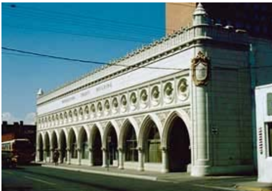
Glazed architectural terra-cotta was a practical and highly decorative building material.

Ceramic veneer was developed during the 1930s and is still used extensively in building construction today. Unlike traditional architectural terra-cotta, ceramic veneer is not hollow cast, but is as its name implies: a veneer of glazed ceramic tile which is ribbed on the back in much the same fashion as bathroom tile. Ceramic veneer is frequently attached to a grid of metal ties which has been anchored to the building.