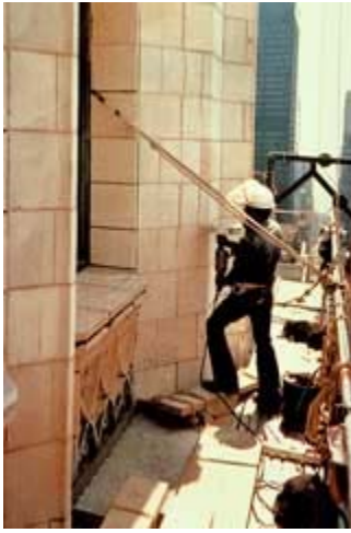
A worker cleans out mortar joints in preparation for repointing the architectural terra-cotta.

the terra-cotta unit. Repointing with waterproof caulking compounds or similar waterproof materials should never be undertaken because, like waterproof coatings, they impede the normal outward migration of moisture through the masonry joints. Moisture then may build sufficient pressure behind the waterproof caulk and the glaze on the terra-cotta to cause damage to the unit itself.