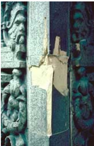
The damage shown here is the result of direct live load on a mid-rise building. The steel frame has settled and shifted the weight onto the exterior terra-cotta cladding, resulting in rupturing of the material.

The deterioration of materials adjoining the glazed architectural terra-cotta (flashing, capping, roofing, caulking around windows and doors) bears significant responsibility in its deterioration. When these adjoining materials fail, largely as a result of lack of maintenance, water-related deterioration results. For instance, it is not uncommon to find wholesale terra-cotta spalling in close proximity to a window or doorway where the caulking has deteriorated.