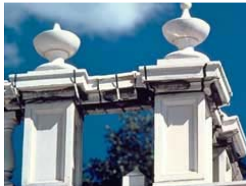
Exposed or freestanding terra-cotta detailing (parapets, urns, balusters, etc.) have traditionally been subjected to the most severe vicissitudes of deterioration as a result of freezing temperatures and water.

Deterioration in glazed architectural terra-cotta is, by definition, insidious in that the outward signs of decay do not always indicate the more serious problems within. It is, therefore, of paramount importance that the repair and replacement of deteriorated glazed architectural terra-cotta not be undertaken unless the causes of that deterioration have been determined and repaired. As mentioned before, one of the primary agents of deterioration in glazed architectural terra-cotta is water. Therefore, water-related damage can be repaired only when the sources of that water have been eliminated. Repointing, caulking and replacement of missing masonry pieces are also of primary concern. Where detailing to conduct water in the original design has been insufficient, the installation of new flashing or weep holes might be considered.