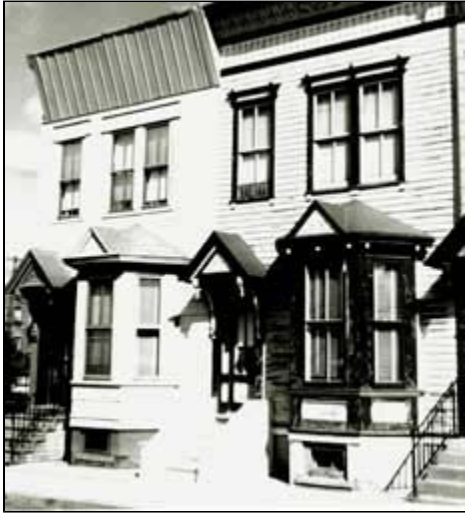
When a building is in need of maintenance, such as the house on the right which needs painting, some owners consider installing aluminum or vinyl siding. The result (see left) can be a complete loss of architectural character due to the covering of details and change of scale due to inappropriate siding dimensions.

preparation is that the furring strips may change the relationship between the plane of the wall and the projecting elements such as windows, door trim, the cornice, or any other projecting trim or molding. Projecting details may also cause a problem. To retain them, additional cutting and fitting will usually be required. Further, additional or special molding pieces, or "accessories" as they are called by the industry, such as channels, inserts and drip caps, will be needed to fit the siding around the architectural features. This custom fitting of the siding will be more labor-intensive, adding to the cost of the siding installation.