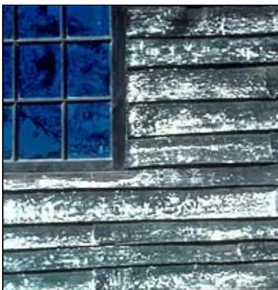
Historic wood siding exhibits rich and varied surface textures. They range from hand-split clapboards of short lengths with feather-edged ends (shown here), to pit or mill sawn boards which can be beveled, rabbeted, or beaded.

A historic building is a product of the cultural heritage of its region, the technology of its period, the skill of its builders, and the materials used for its construction. To assist owners, developers and managers of historic property in planning and completing rehabilitation project work that will meet the Secretary's "Standards for Rehabilitation" (36 CFR 67), the following planning process has been developed by the National Park Service and is applicable to all historic buildings. This planning process is a sequential approach to the preservation of historic wood frame buildings.