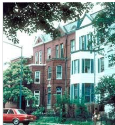
The inappropriate siding applied to the house on the right has altered the character of the urban setting.

As stated earlier, the application of aluminum and vinyl siding is frequently considered as an alternative to the maintenance of the original historic material. The implication is that the new material is an economical and long-lasting alternative and therefore somehow superior to the historic material. In reality, historic building materials such as wood, brick and stone, when properly maintained, are generally durable and serviceable materials. Their widespread existence on tens of thousands of old buildings after many decades in serviceable condition is proof that they are the original economic and long-lasting alternatives. All materials, including aluminum and vinyl siding can fall into disrepair if abused or neglected; however, the maintenance, repair and retention of historic materials are always the most architecturally appropriate and usually the most economically sound measures when the objective is to preserve the unique qualities of historic buildings.