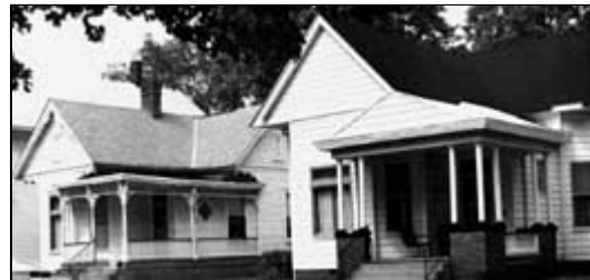
When aluminum was installed on the house on the right, the barge boards, scrollwork, columns, and railings were removed. The distinctive shingled gable and attic vent were covered, further compromising the building's architectural integrity.

The primary concern, therefore, in considering replacement siding on a historic building, is the potential loss of those features such as the beaded edge, "drop" profile, and the patterns of application. Replacing historic wood siding with new wood, or aluminum or vinyl siding could severely diminish the unique aspects of historic materials and craftsmanship. The inappropriate use of substitute siding is especially dramatic where sufficient care is not taken by the owner or applicator and the width of the clapboards is altered, shadow reveals are reduced, and molding or trim is changed or removed at the corners, at cornices or around windows and doors. Because substitute siding is usually added on top of existing siding, details around windows and doors may appear set back from the siding rather than slightly projecting; and if the relationship of molding or trim to the wall is changed, it can result in the covering or removal of these historic features. New substitute siding with embossed wood graining--intended to simulate the texture of wood--is also visually inappropriate. Exaggerated graining would have been undesirable on real wood siding and is generally found only after sandblasting, a destructive and totally unacceptable treatment for wood.